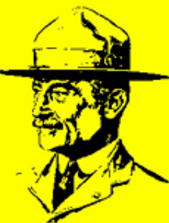
Founder of scouting Sir Robert Baden- Powell