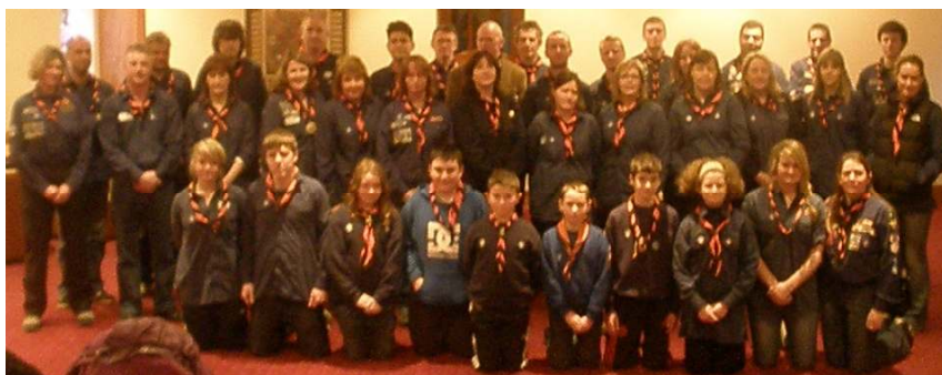
Scouts and Scouters of 2nd Mayo Westport pictured during their Transition Training Day.