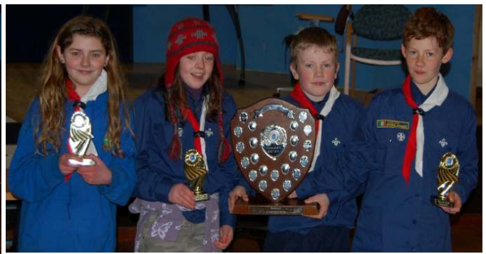
11th Sligo Benbulben Scouts winners of Yeats County Scout Quiz.