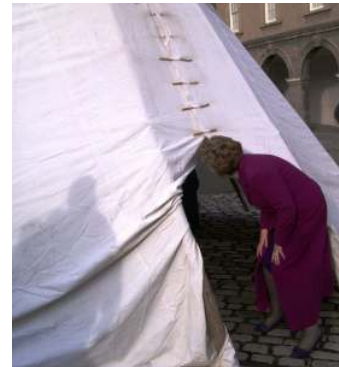
The President visited the Scouting Ireland Display and spoke with the Scouts.

of the Scout and Rover Scout Teams, The Training Team was also represented.